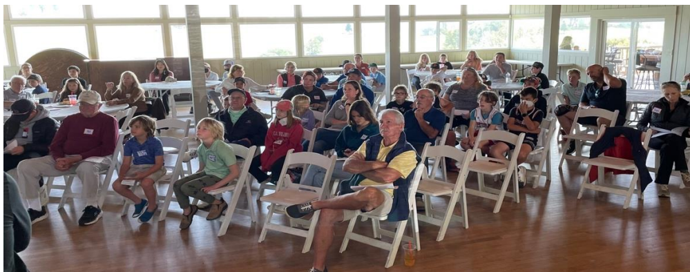
Attendees at March 13 th PG&CC Junior Golf Orientation